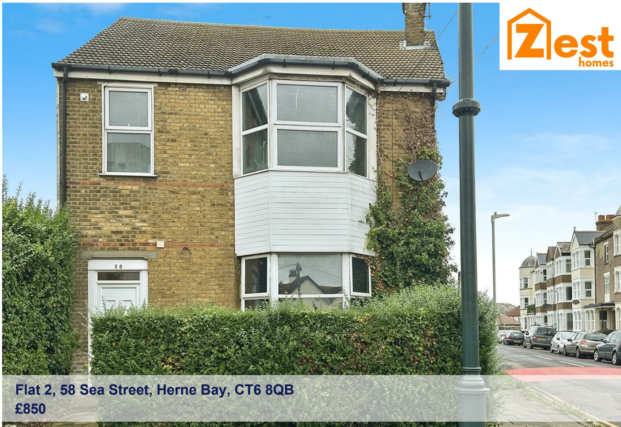
Flat 2, 58 Sea Street, Herne Bay, CT6 8QB £850